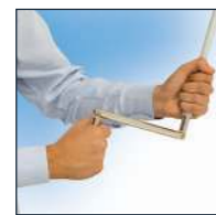
Crank Handle (Face Fit Only)