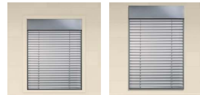
Reveal Fit (In) Installation

Everlast™ External Venetian Blinds can be mounted and installed within a window recess or frame, or to the face of a wall.