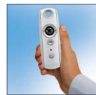
Remote Control With 240V Electric Somfy RTS Motor