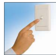
Wall Switch With 240V Electric Somfy Motor